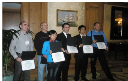
Broadband Forum G-PON Certification Certificate Award Ceremony