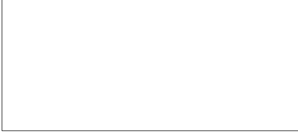
Figure 3. Loss of Signal (LOS) alarm condition

This alarm would indicate that an IWF was no longer able to send data to the ATM network. The condition is shown in figure 3 below. If the IWF is configured as a DTE, then the detect LOS alarm indicates that one of the following conditions had occurred: loss of data signal, loss of clock signal, Data Set Ready is no longer set, or Clear to Send is no longer set. If the IWF is configured as a DCE, then the detect LOS alarm indicates that one of the following conditions had occurred: loss of data signal, loss of clock signal, Data Set Ready is no longer set. If the IWF is configured as a DCE, then the detect LOS alarm indicates that one of the following conditions had occurred: loss of data signal, loss of clock signal, Data Terminal Ready is no longer set, or Request to Send is no longer set.